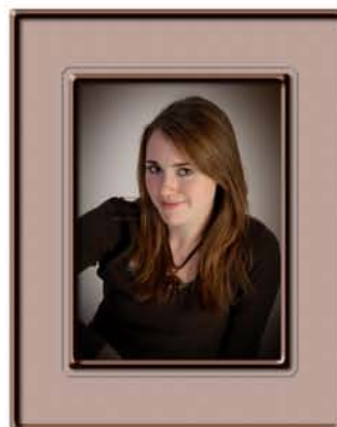
Card 12 (Brown Shown) -4x5 - 2" white space on lower edge