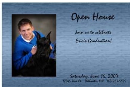
Card 11 (Blue Shown) -4x6